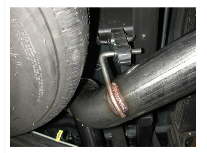
Step 5. With all components mounted loosely, adjust the system for overall aesthetics and clearance of frame & bodywork. (MAGNAFLOW recommends at least 1/2" of clearance between the exhaust system and any body panels to prevent heat-related body damage or fire.)