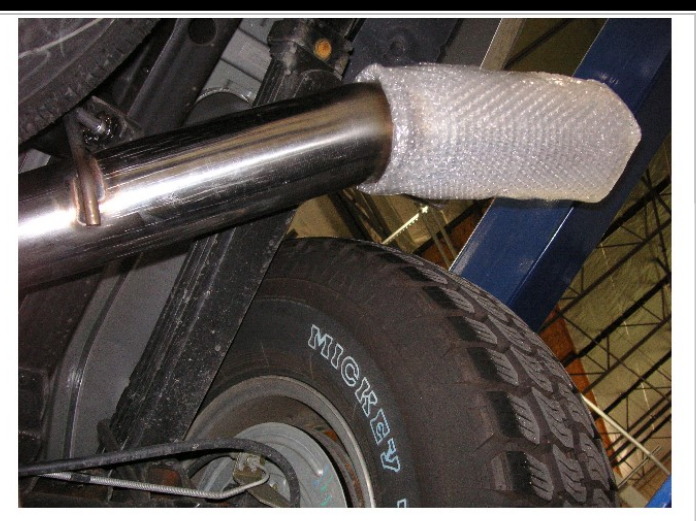
Step 6. Once a final position has been chosen for the new exhaust system, evenly tighten all clamps from front to rear using the torque specifications on page one of the instructions. Inspect all fasteners after 25-50 miles of operation and re-tighten if necessary.

MAGNAFLOW: 1901 Corporate Centre Dr - Oceanside, CA 92056 | 1(800)990-0905 Technical Support: 1(800) 959-9226 | Email: moreinfo@magnaflow.com