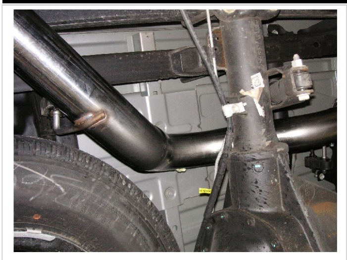
Step 4. Loosely install the Over Axle Pipe and Tail Pipe Assembly using the supplied Hanger Clamps. The Outlet may be trimmed as desired.